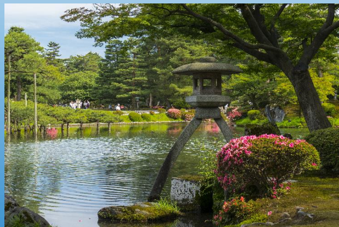
Kenrokuen park